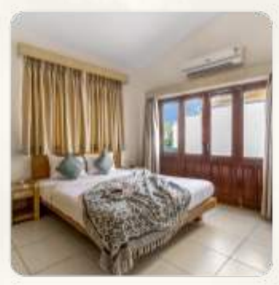
Bedroom 2 1 King Bed