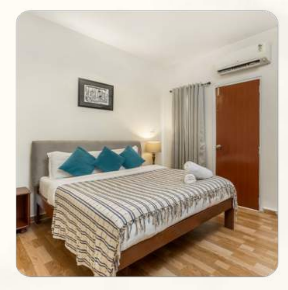
Bedroom 1 1 King Bed