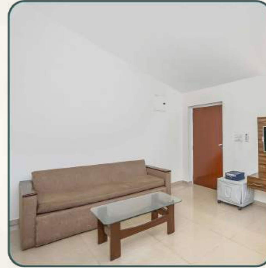
Living Room 2 Floor Mattresses