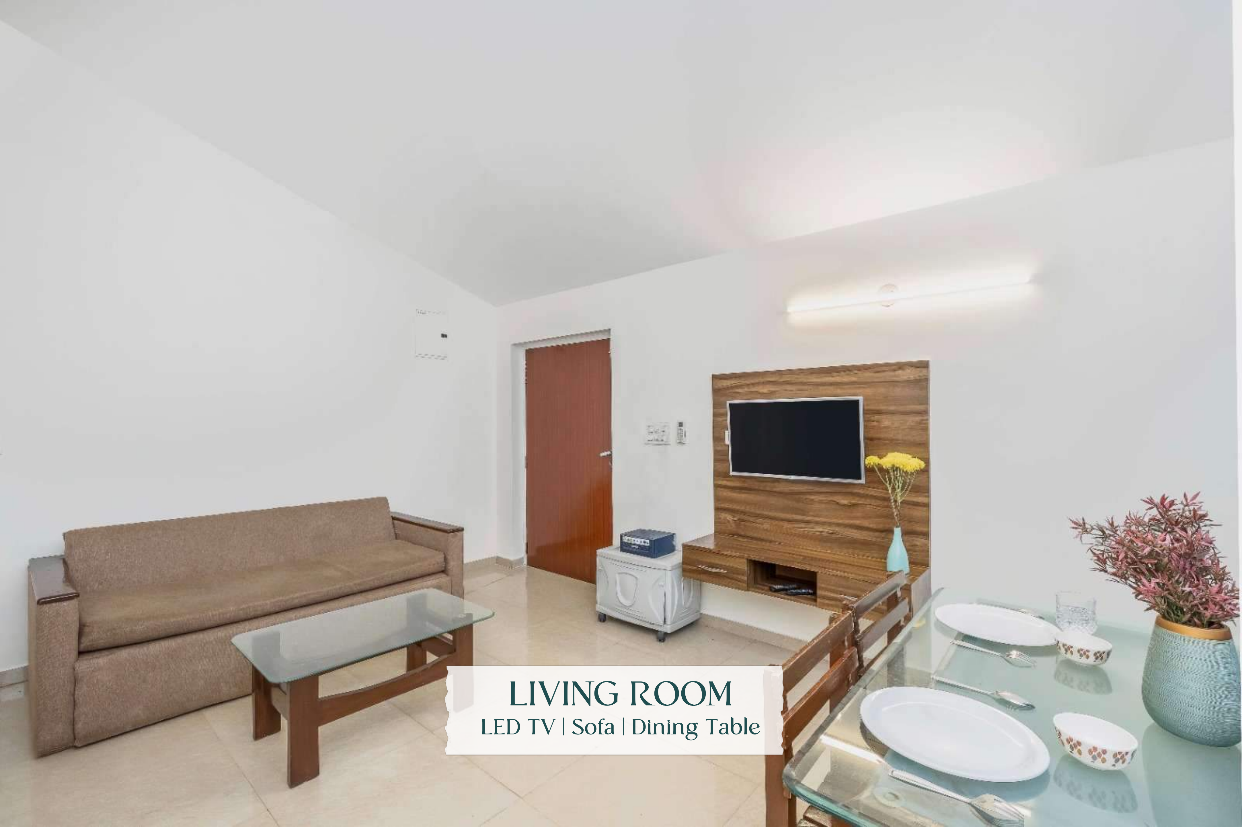
LIVING ROOM LED TV | Sofa | Dining Table