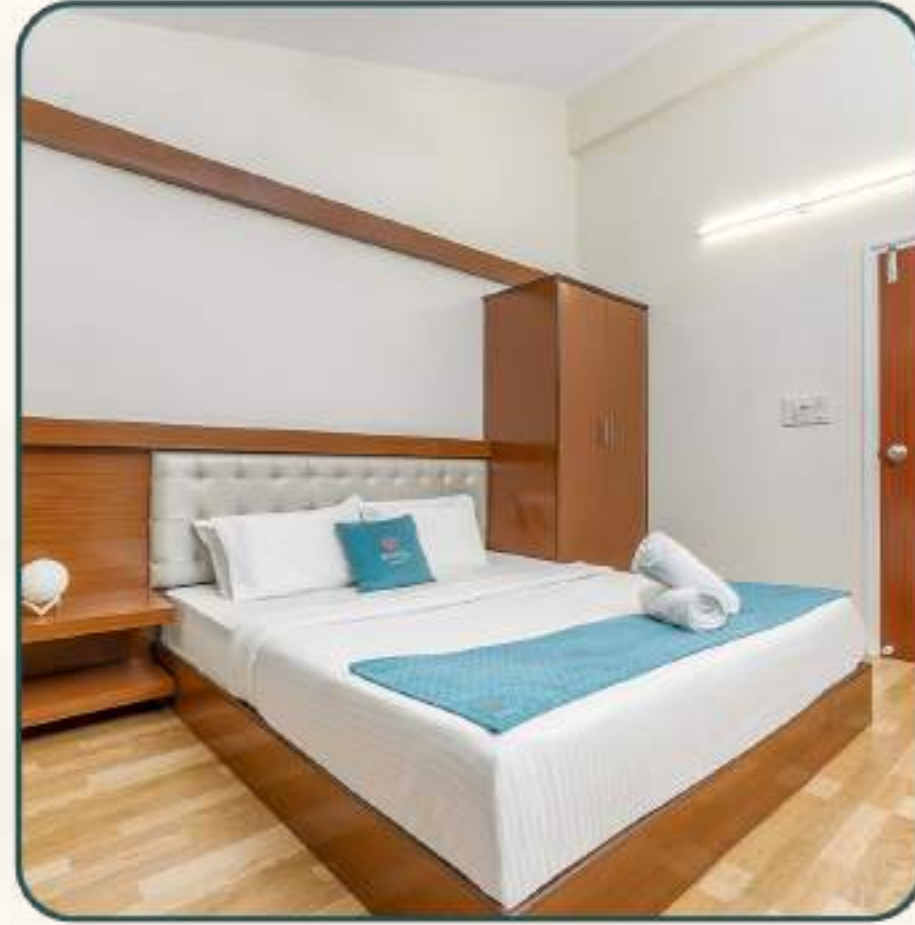
Bedroom 1 King Bed