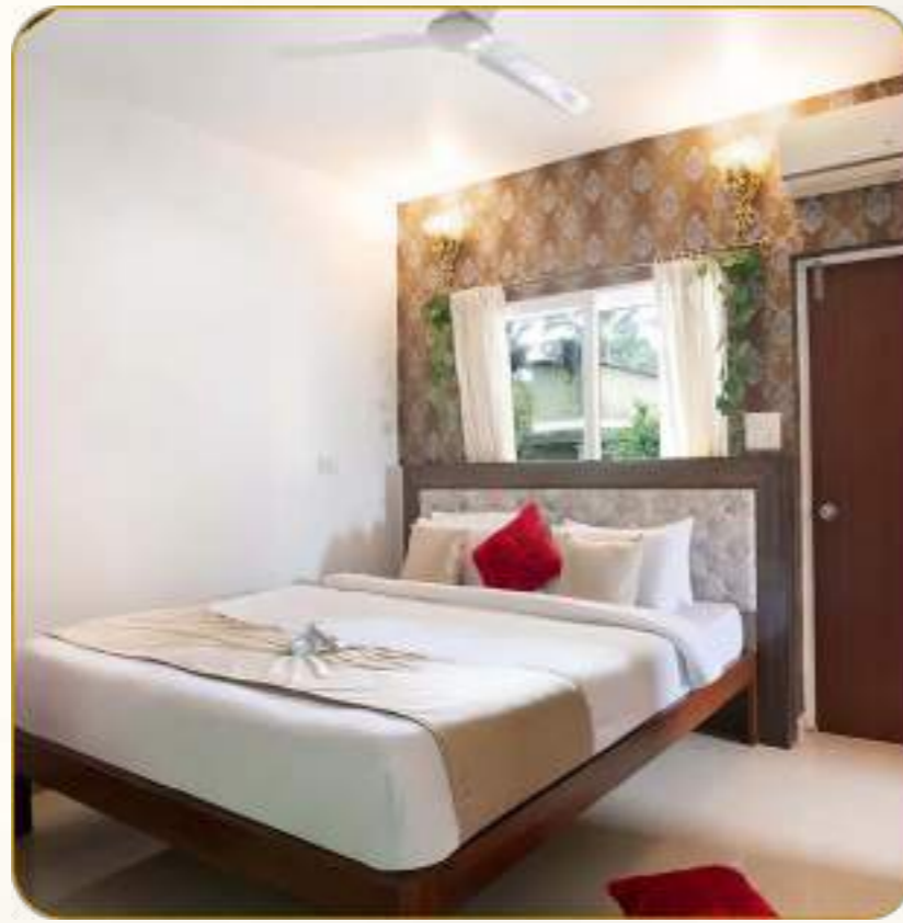
Bedroom 1 1 King Bed