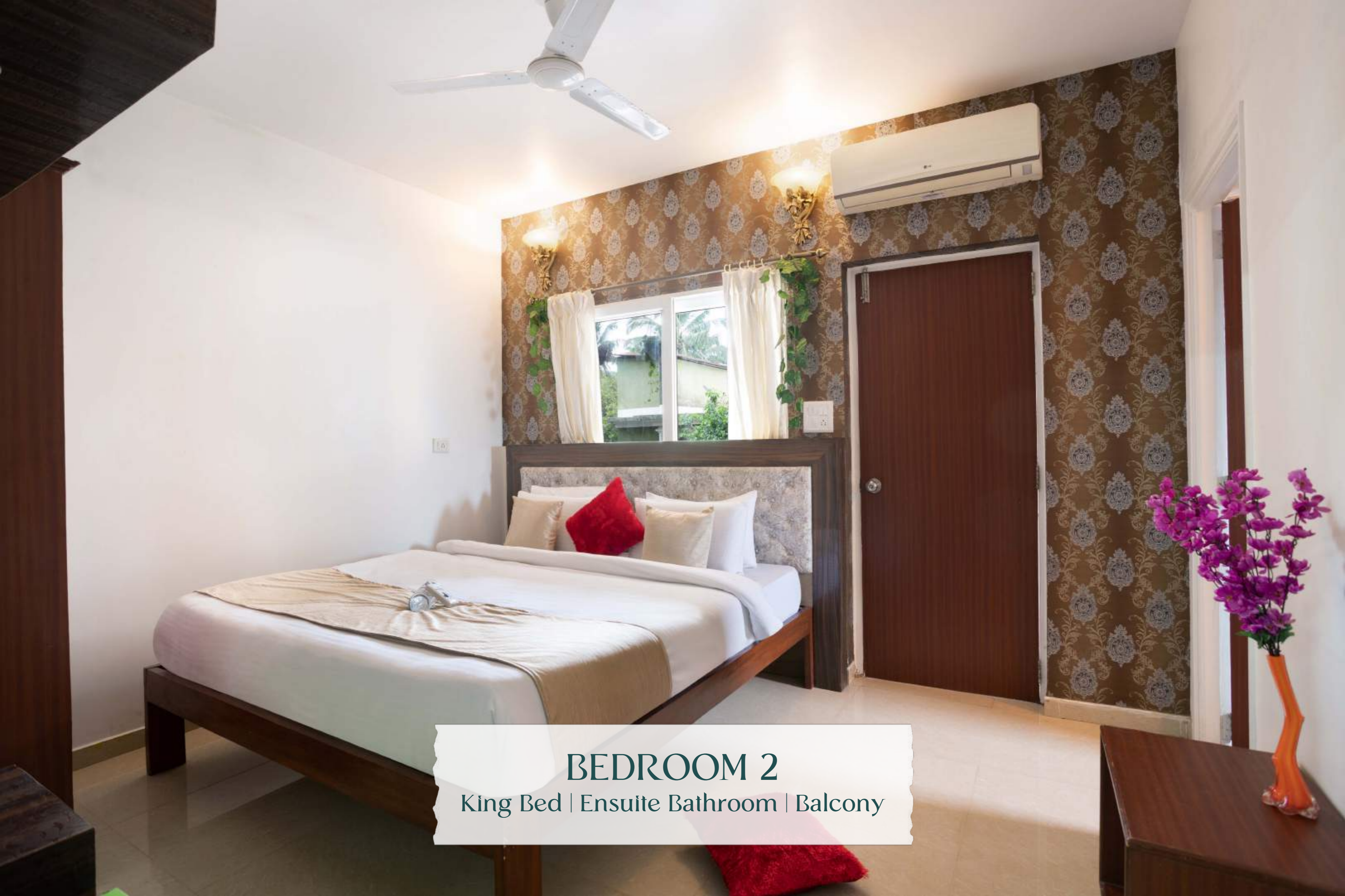
BEDROOM 2 King Bed | Ensuite Bathroom | Balcony