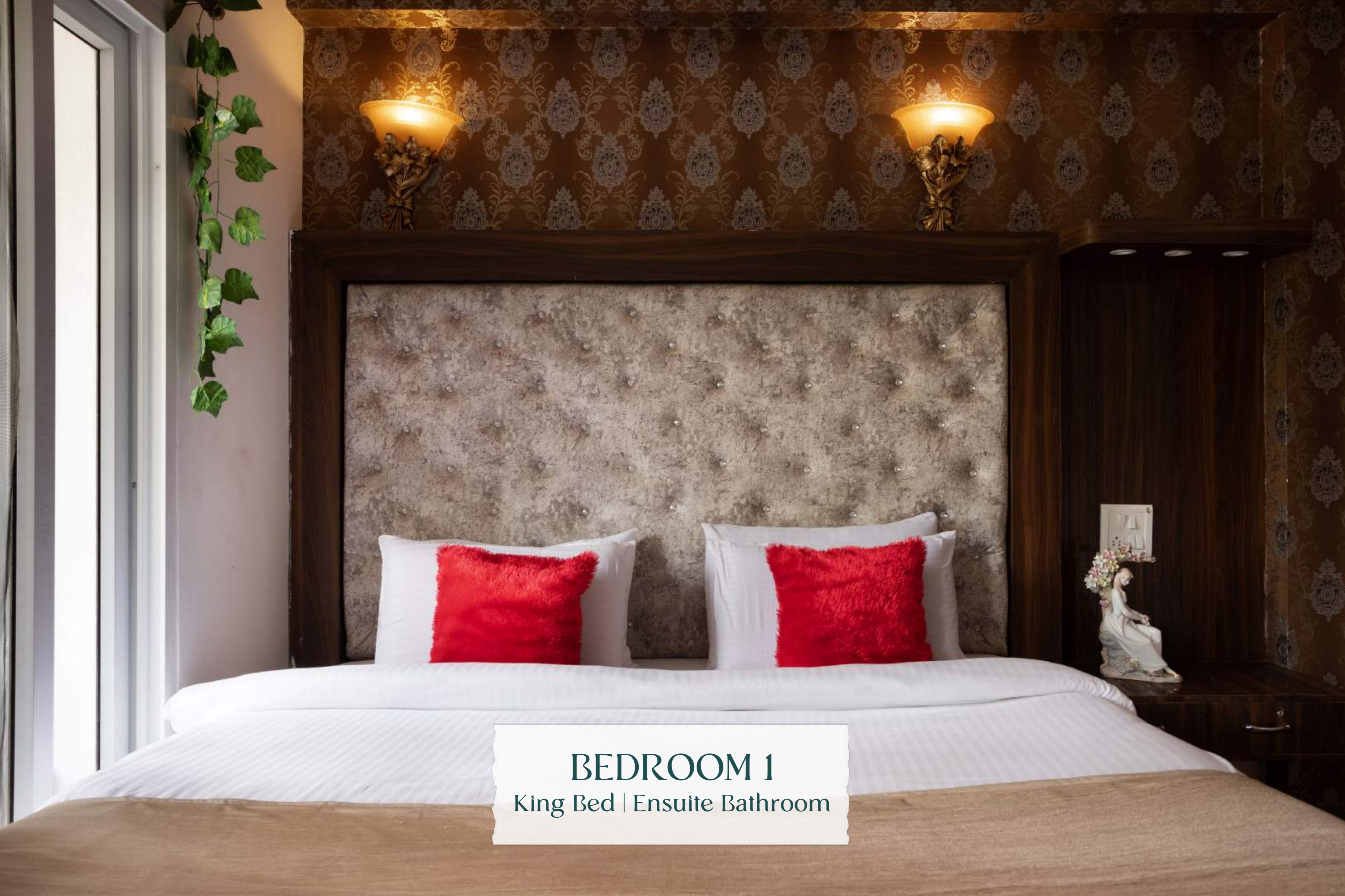
BEDROOM 1 King Bed | Ensuite Bathroom