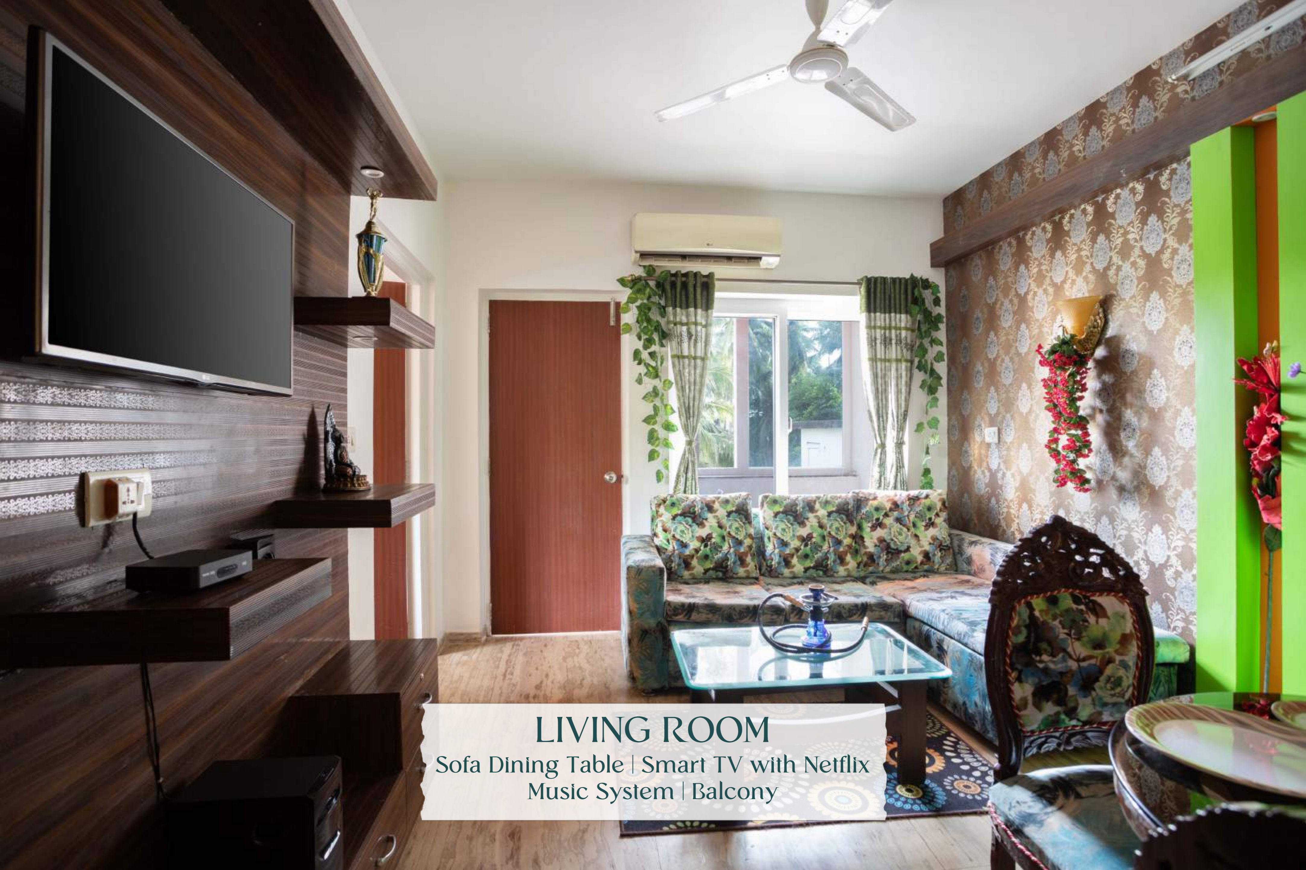
LIVING ROOM Sofa Dining Table | Smart TV with Netflix Music System | Balcony