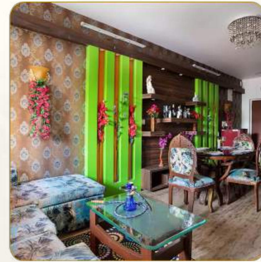
Living Room 2 Floor Mattresses