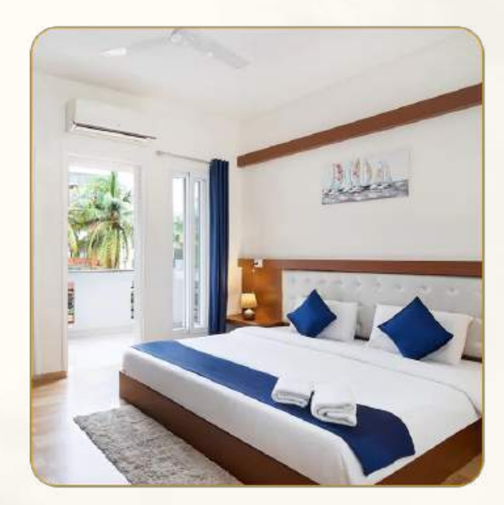
Bedroom 1 1 King Bed