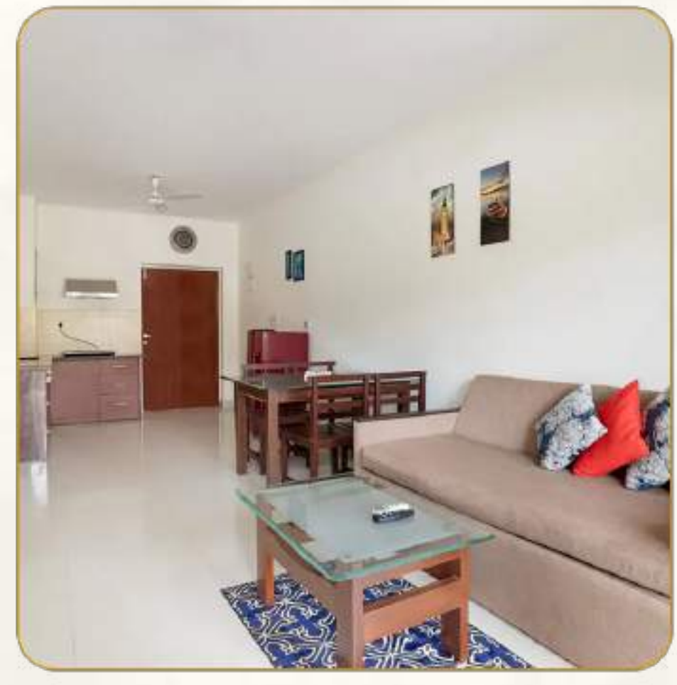
Living room Floor Mattresses