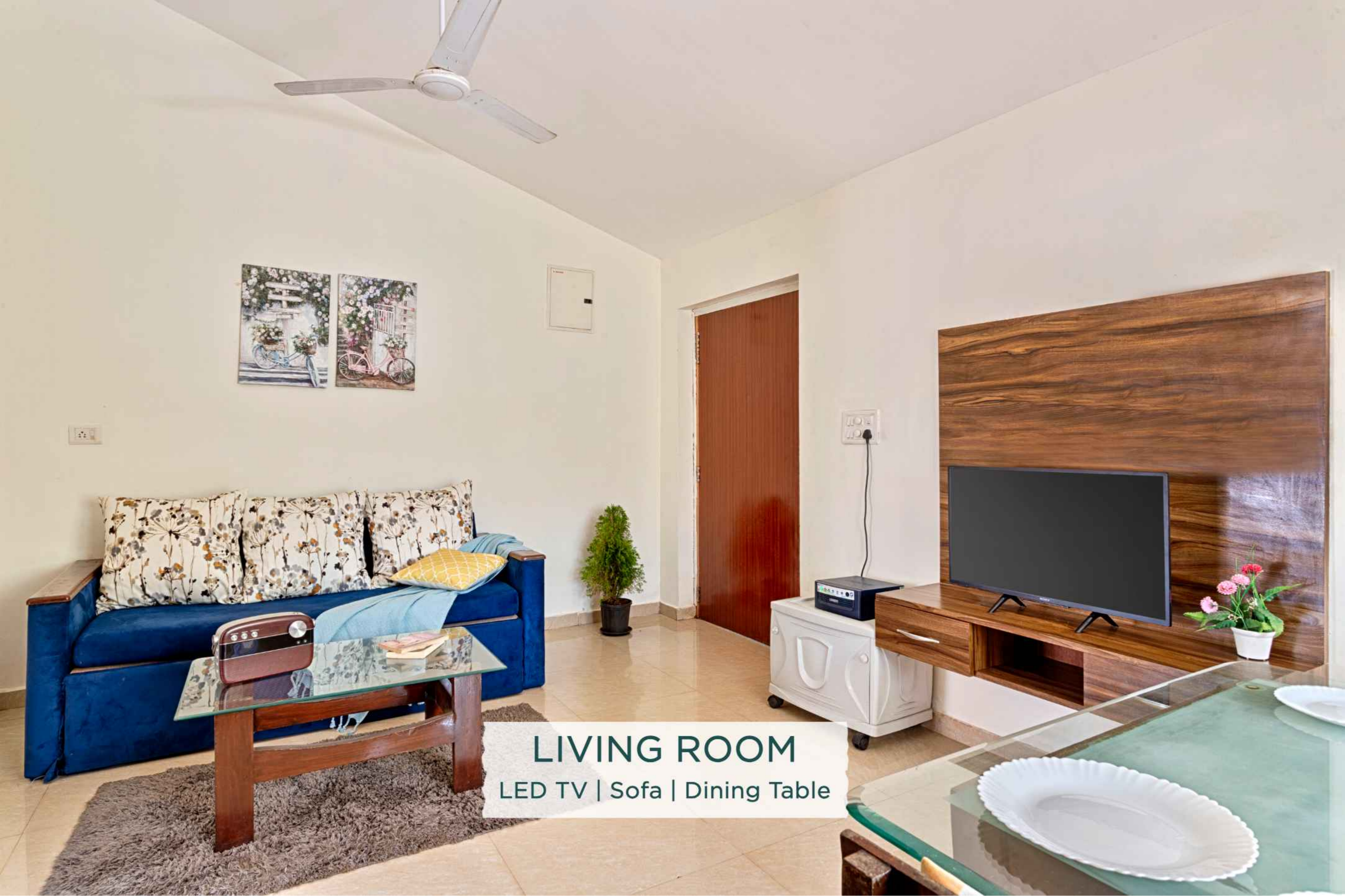
LIVING ROOM LED TV | Sofa | Dining Table