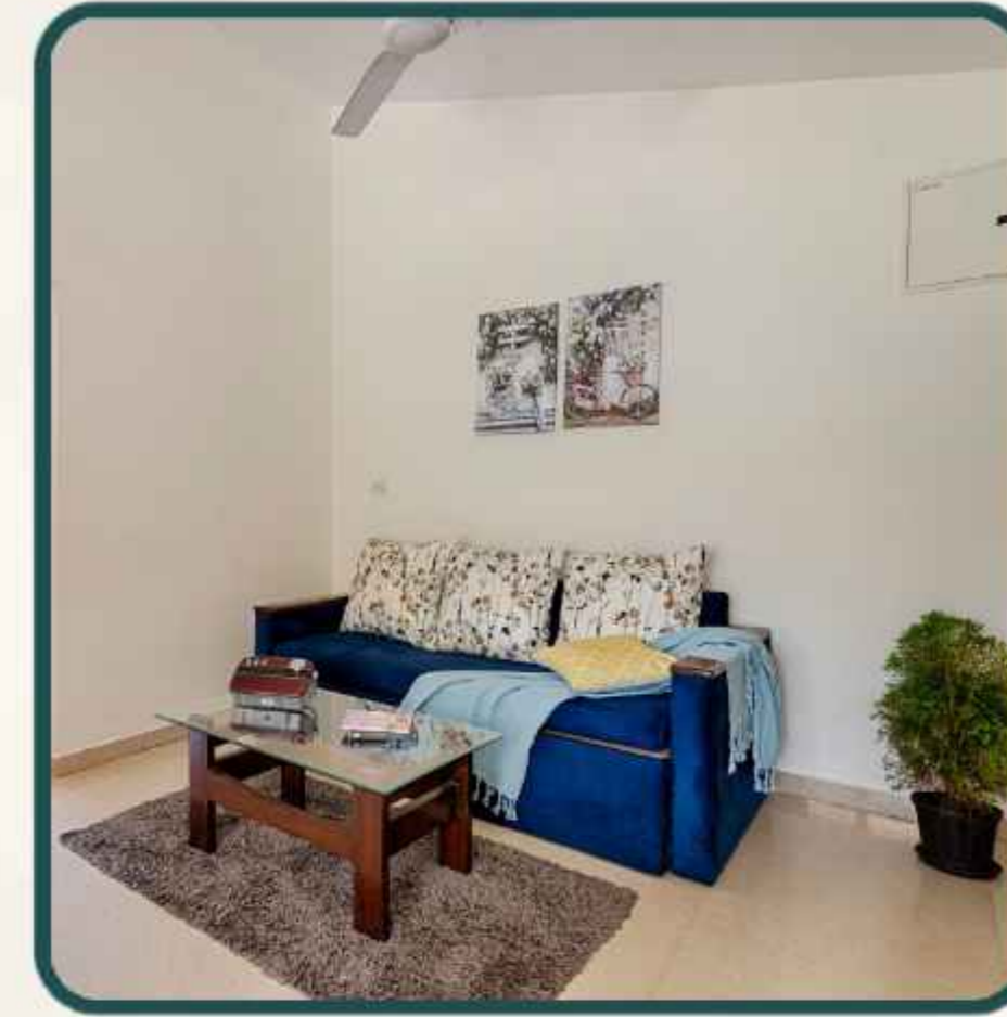
Living Room 2 Floor Mattresses