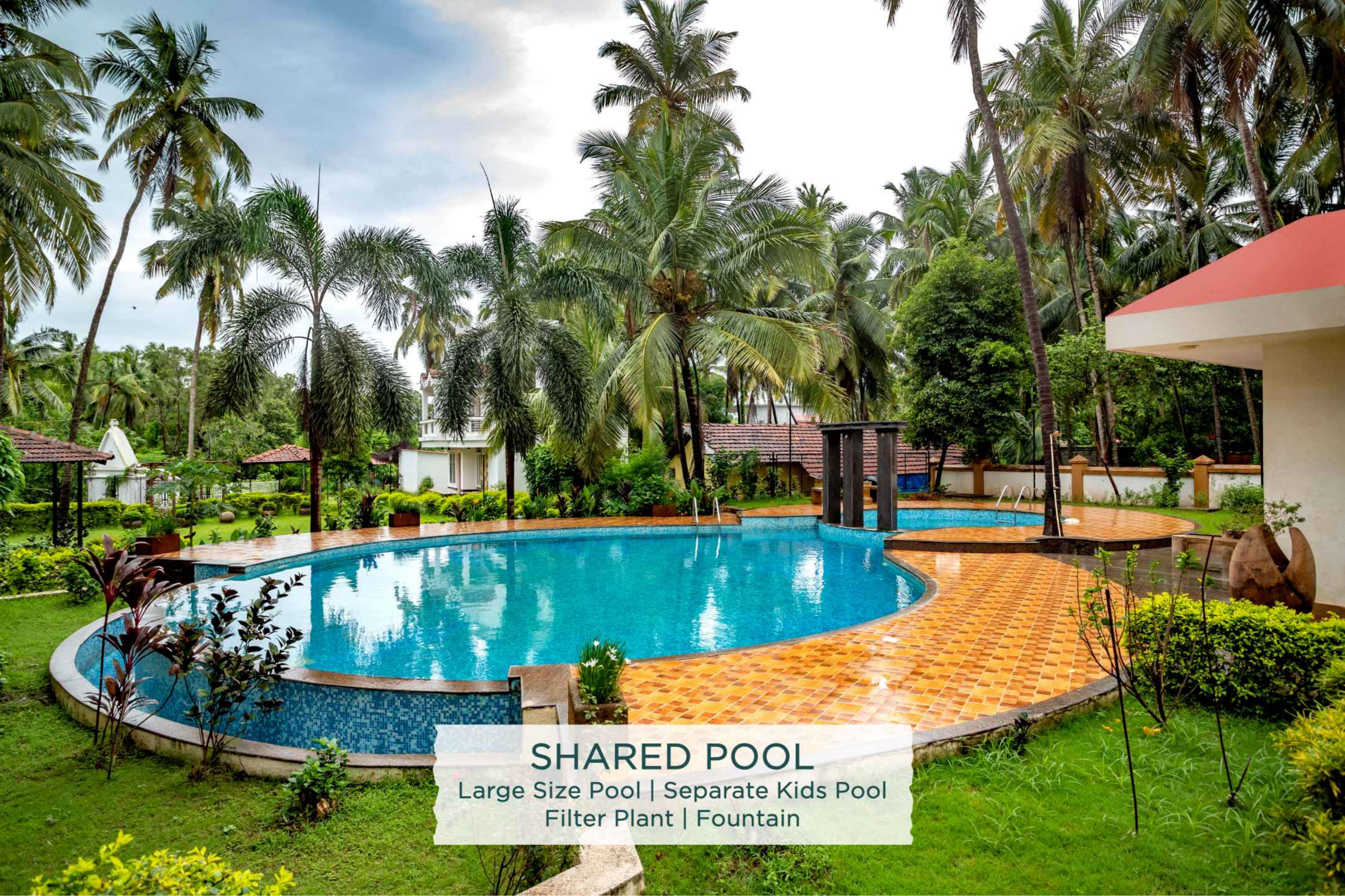
SHARED POOL Large Size Pool | Separate Kids Pool Filter Plant | Fountain