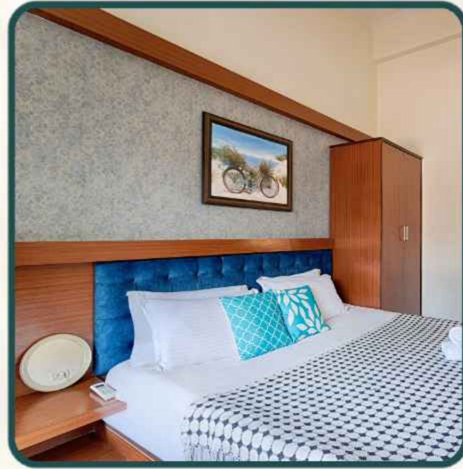
Bedroom 1 King Bed